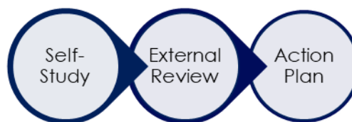
Figure 1: Elements of APR

As displayed in Figure 1, the self-study and external review should result in an action plan aimed at improving student outcomes with steps to be implemented over the next one to five years. That action plan is monitored through the annual assessment process.