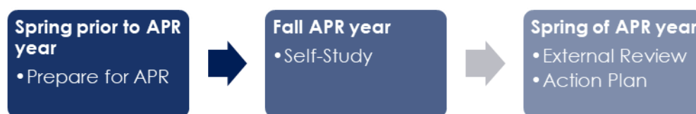
Figure 2: APR Process and Timeline

The APR process is typically completed in three phases over three long semesters (see Figure 2). Programs are expected to adhere to this timeline and complete their APR on schedule. 1 A more comprehensive timeline for each phase of the APR process, including specific tasks and responsible individuals, is provided in Appendix A of this handbook.